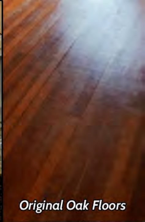
Original Oak Floors