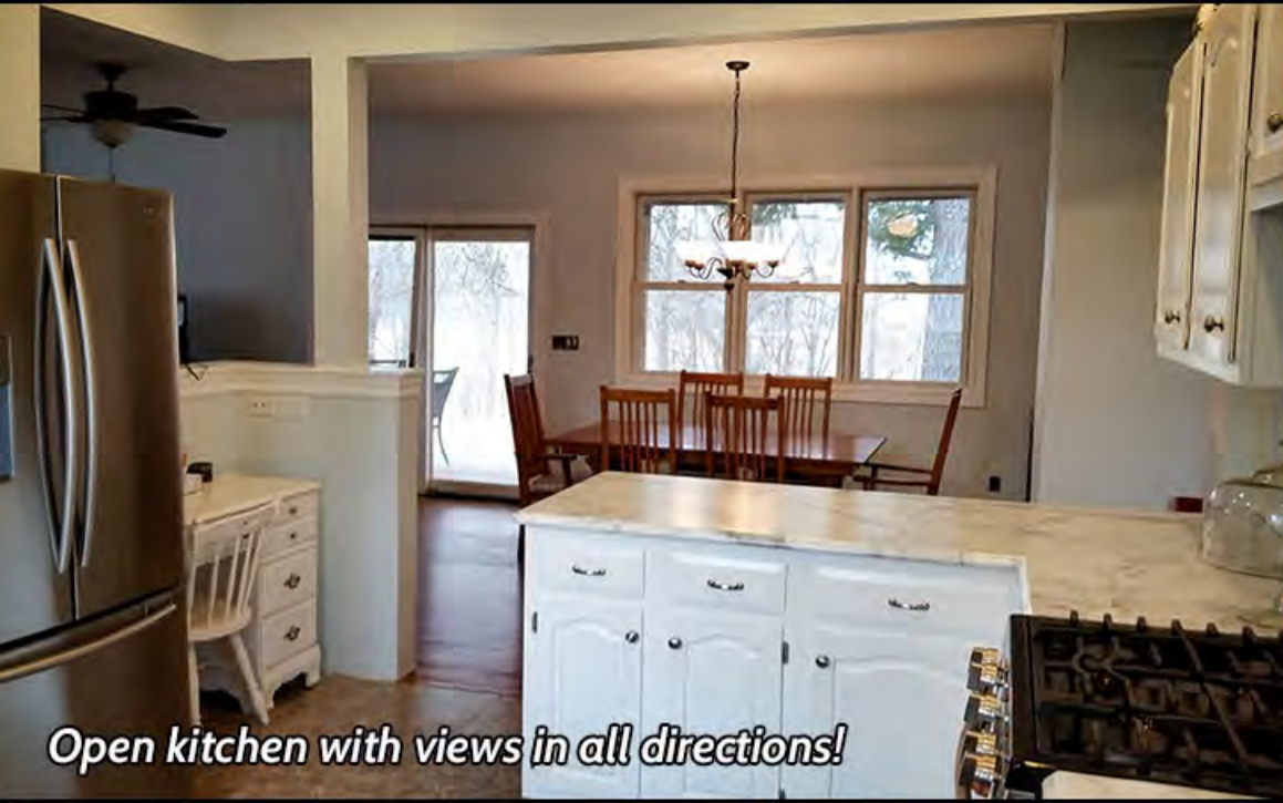
Open kitchen with views in all directions!